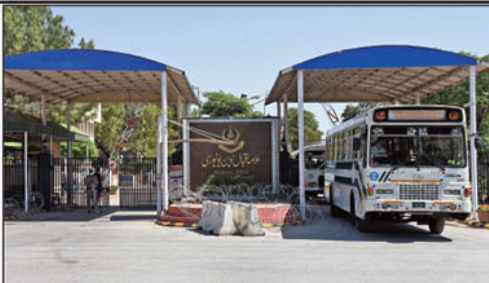
ISLAMABAD: A view of Allama Iqbal Open University in Federal Capital as the University administration postpone the examination Autumn Semester 2021 due to the pandemic of third layer of Corona Virus across the country.