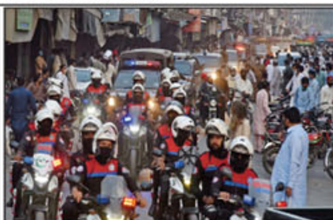
FAISALABAD: Army and Police Personnel are patrolling in Karkhana Bazaar as Pak army is deployed to implement new restrictions as a preventive measure against the spread of the Covid-19 in city.

Till now 7,990 individuals have lost their lives to the epidemic in Punjab 4,599 in Sindh, 3,134 in KP, 665 in Islamabad, 462 in Azad Kashmir, 232 in Balochistan, and 105 in GB. NNI