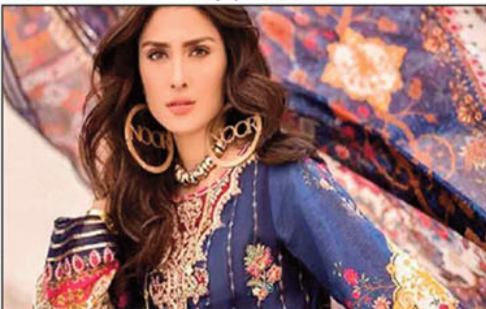
The "Mere Paas Tum Ho" star on Sunday said she has reached 8.7 million followers on the Facebook-owned app.

"I think although she wants to do her duties she will step back, even more, it'll be quite hard to come back after the pandemic and all the isolation. "In fact, she will be grateful for him to be taking over in making I imagine quite big decisions on behalf of the Royal Family." The News..