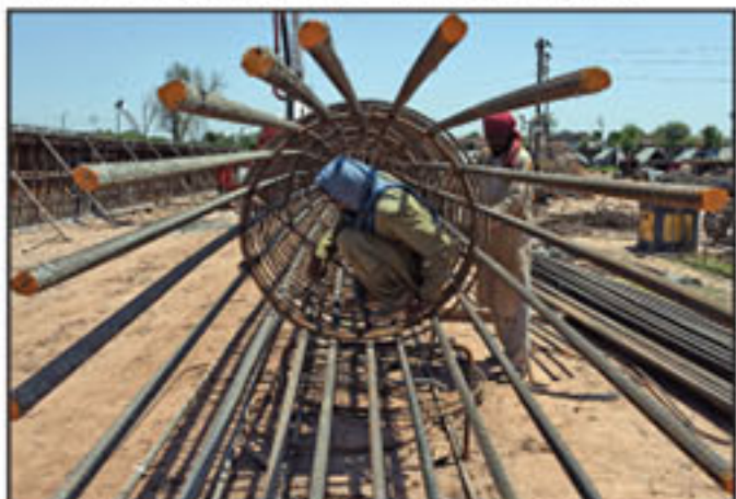
ISLAMABAD: Laborers are busy in preparing structure of pillars during construction of Rawal interchange in Federal Capital.

The Finance Minister reiterated the firm commitment of the Government in implementing vital economic reforms and achieving macro-economic stability with the help of development partners to build a better future for the people of Pakistan. Christian Turner discussed the issues of mutual interest and assured the Finance Minister of the full support.