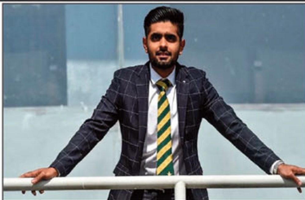
Pakistani skipper Babar Azam made history once again by shattering a record previously held by Virat Kohli, becoming the fastest batsman to get to 2,000 T20I runs.

"Best wishes to all in India. Frightening Covid numbers. #IPL continues. Inappropriate? Or important distraction each night? Whatever your thoughts, prayers are with you," tweeted the former Test player. Dawn..