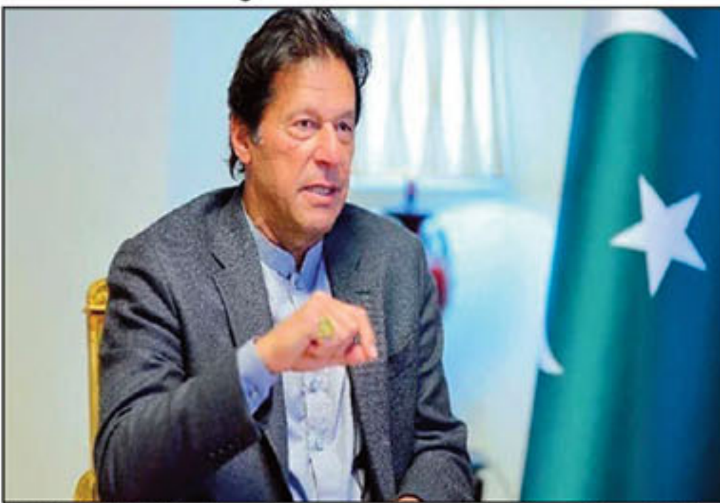
ISLAMABAD: Ahead of the April 29 by-elections, Prime Minister Imran Khan has been named by voters of Karachi's NA-249 constituency as their favourite political leader, maintaining an edge over PMLN's Nawaz Sharif.

In two out of three polls conducted, PM Imran Khan was named as the favourite, while in the third, Nawaz Sharif was declared the most popular. Ipsos, Pulse Consultant, and Gallup Pakistan released survey findings based on the opinion of 1,200 to 1,400 registered voters of the constituency.