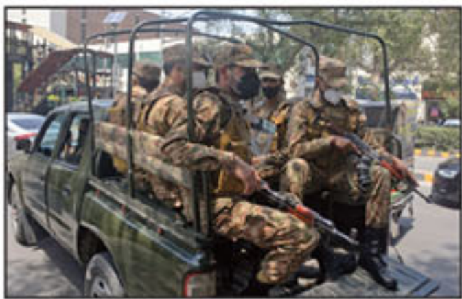
LAHORE: Army Personnel are patrolling on Mall Road to implement new restrictions as a preventive measure against the spread of the Covid-19 in Provincial Capital.

He said that the extraordinary increase in electricity and gas prices has created havoc in the country by bringing a tsunami of inflation today due to high prices of electricity and gas. Declining demand for Pakistani products is also affecting the export sector, he said, adding that a possible increase in gas prices would make fertilizer more expensive, leaving 43 per cent of the country's agricultural manpower and 20 per cent of GDP affected. NNI