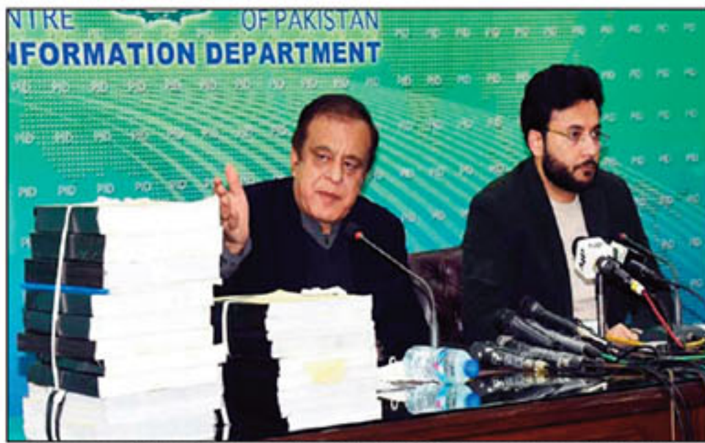
Islamabad: Minister for Information Shibli Faraz on Sunday asked the Opposition parties to quit "hiding behind rallies" and submit details of their funding to the Election Commission of Pakistan's scrutiny committee.

The minister said that following orders by the Supreme Court, the PTI had provided all the details of the donations received by "party workers and sympathisers" during the 2018 election