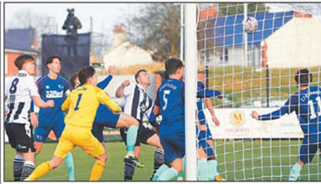
LONDON: Non-league Chorley knocked coronavirus-ravaged Derby County out of the FA Cup with a surprise 2-0 win on Saturday, while Everton survived a scare against Rotherham as the spiking pandemic took its toll on the third round.

"I like his cover drives and want to play like him," said the middle-order batsman. The News..