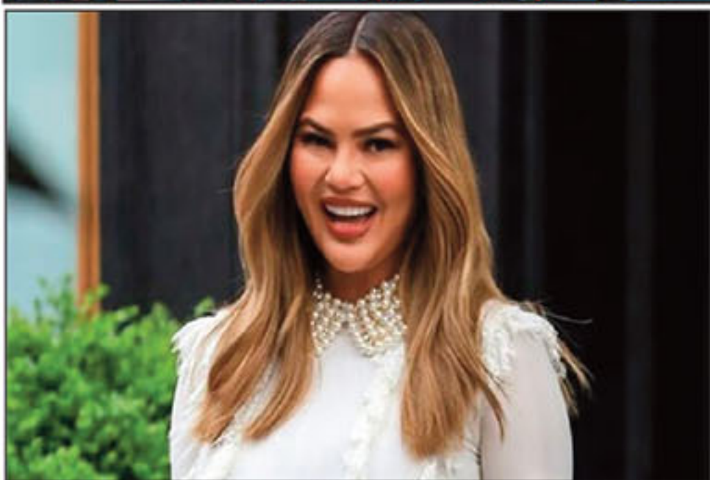
According to multiple videos on Twitter, the model was struggling to put on a pair of horse riding boots.