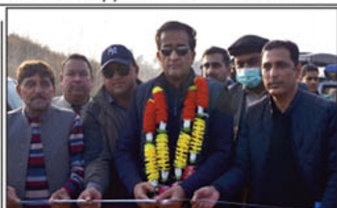
ATTOCK: Special Assistant for Climate Change Malik Amin Aslam cutting the ribbon during inauguration of Chichi Village Cricket Tournament at a cricket ground.

Domestic and industrial consumers are facing shortage of gas across Pakistan since the winter season fell. CNG stations are being closed in Sindh, Balochistan, Punjab and Khyber Pakhtunkhwa due to non-availability of the gas. The users have to buy LNG to cook food and keep themselves warm in harsh winters. NNI