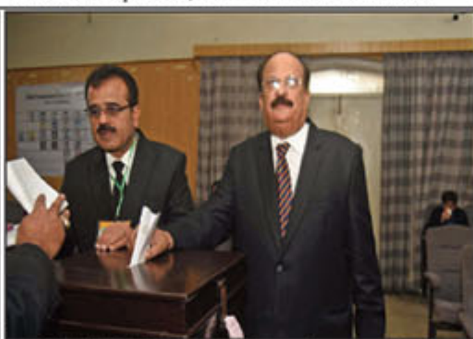
FAISALABAD: lawyer is casting vote during election of District Bar at District Court in city.

"Pakistan had to respond and our response was very loud and clear," he stressed, adding that India needed to learn from the incident.