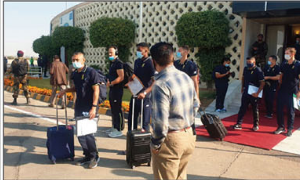
The South African cricket team arrived in Karachi on Saturday to play two Tests and three Twenty20 internationals on their first tour of Pakistan in 14 years.

Rohit and Pujara built a 49-run partnership before the former threw away his wicket for 44 when he attacked Lyon and top-edged to Starc at long-on. Dawn..