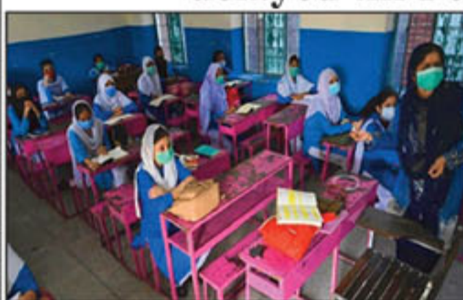
ISLAMABAD: The government has delayed the return of students of nursery to 8th classes to schools till February 1.

However, the ninth and 10th graders and college and university students will resume classes, as announced earlier. The development