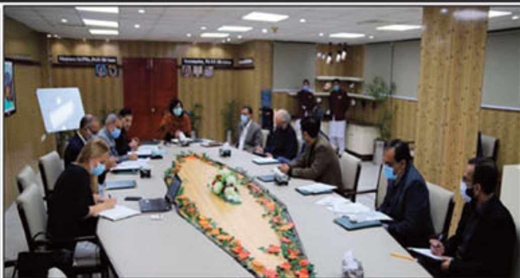
ISLAMABAD: Special Assistant to Prime Minister on Poverty Alleviation and Social Safety Sania Nishtar convenes a consultation on integrated beneficiary targeting for the upcoming One Window Ehsaas Service in Federal Capital.