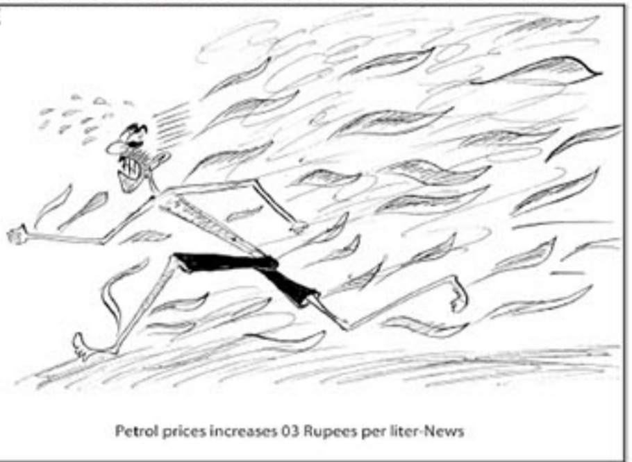
Petrol prices increases 03 Rupees per liter News