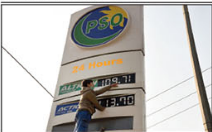
ISLAMABAD: A worker of petrol pump is changing the price digits on the price board as this is the third time in four weeks that fuel prices have been increased, which is unbearable for people.

The Azad Kashmir president said that none of the leaders of the resistance movement including Syed Ali Gilani, Mirwaiz Umar Farooq, Yasin Malik, Shabbir Ahmad Shah, Asiya Andrabi, Musarat Alam Butt and others belonged.