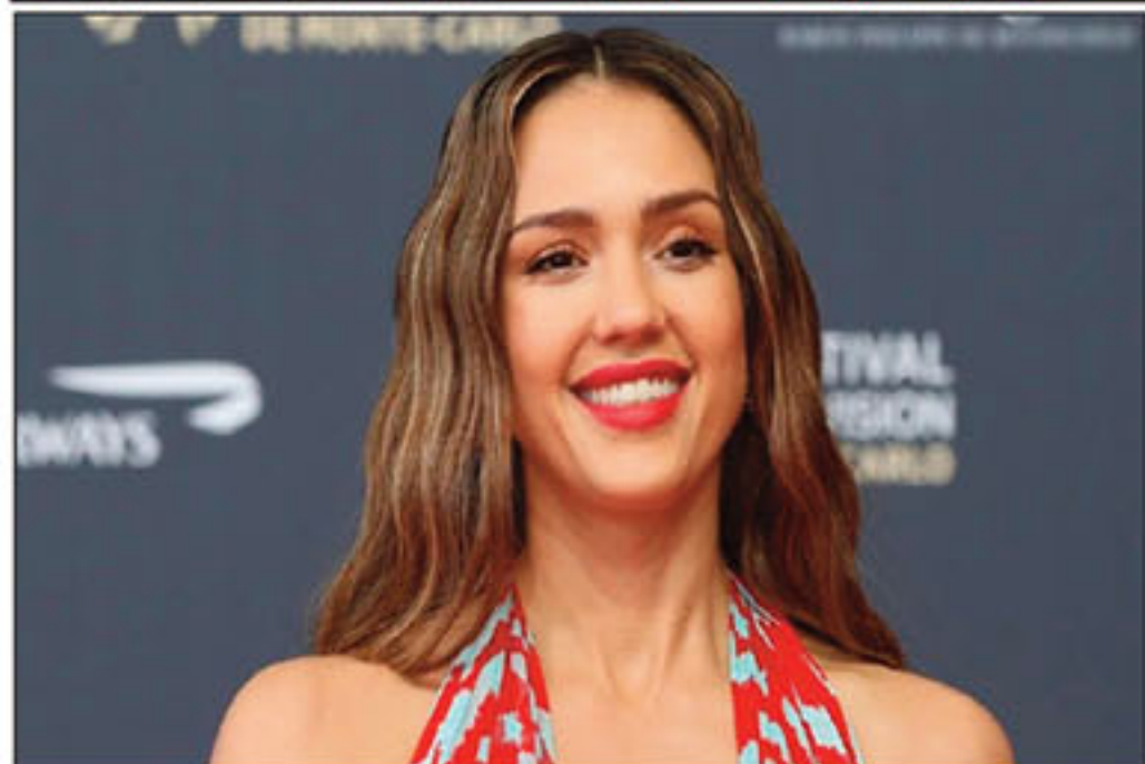
Emmy award-winning actress Jessica Alba spills the beans behind her daughter's reaction to learning about her Hollywood fame.