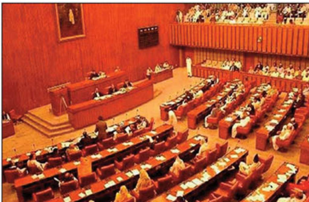
The Election Commission of Pakistan has stated that in order to switch from secret balloting to an open ballot method, an amendment to the Constitution will be required.

spokesperson said the open ballot method is in contrast to the very "soul" of the Constitution.