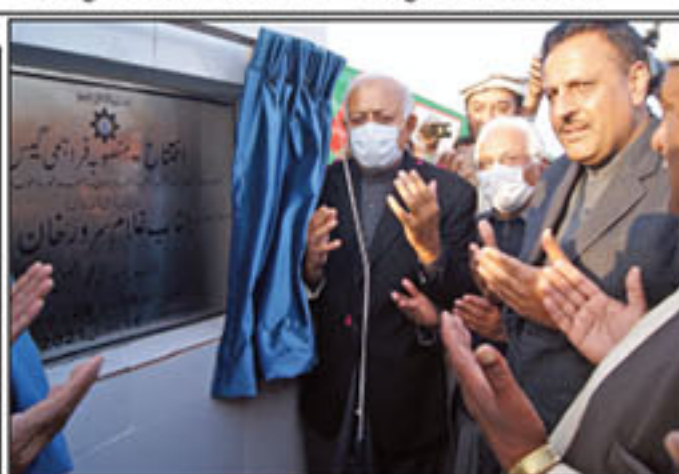
RAWALPINDI: Federal Minister for Aviation Ghulam Sarwar Khan prying after inaugurating the Sui Gas project at Kotla area of the city.

The business leader said that Ogra has repeatedly failed to safeguard the interests of masses, therefore, reforms should be introduced coupled with improved regulations so that it can take proper action if the private sector try to form a cartel to skin masses, he demanded.